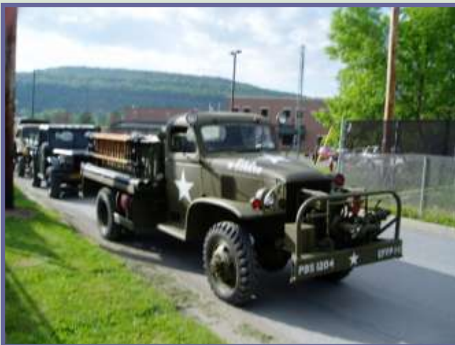
Bob Muller's Fire truck is in great form and ready to go