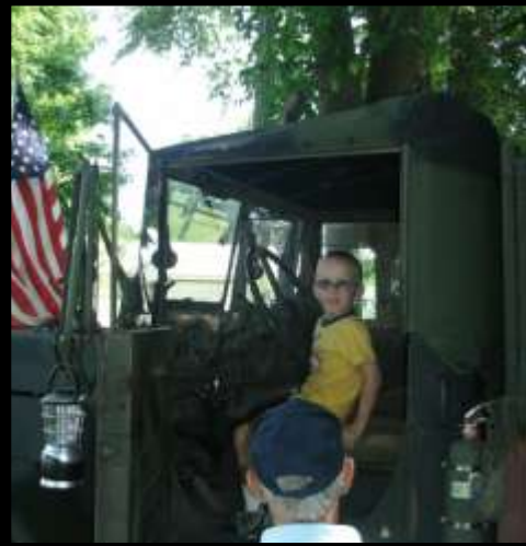
Future Military Vehicle owner "In Training"