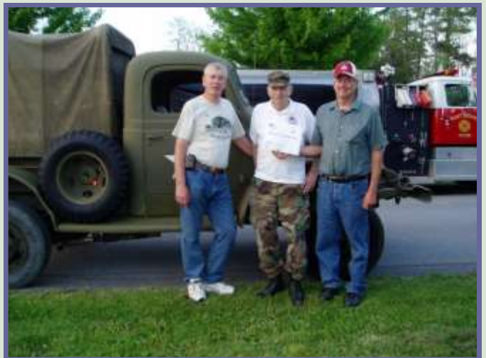
The contingent of WWII vehicles won BEST MOTORIZED VEHICLES and here are the drivers holding the certificate. There was also a prize of $50 along with this.